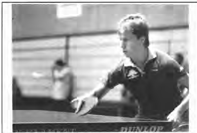
Jan-Ove Waldner 1992 Olympic Champion

THE new Olympic Champion Jan-Ove Waldner, reputed to be the sport's first millionaire, is also doing quite nicely on the World All Star circuit. At the last count he was second in the money stakes having earned $123,400. Only Ma Wenge (China) can top that with $124,600. The circuit is becoming more successful by the week. Spectators are increasing and players are earning more money.