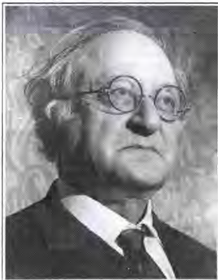
The Hon. Ivor Montagu

trators and sportsmen of this era; they laid the foundations of the exciting sport we have today.